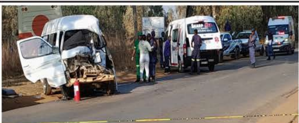
Emergency response teams and SAPS officials attended to the crash site