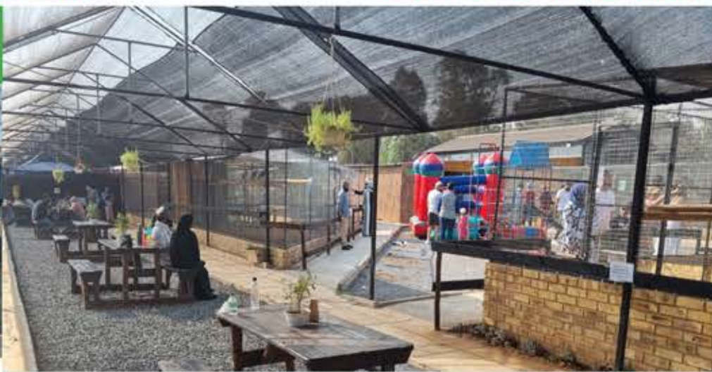
The entrance to the park (left) and where you can sit and relax inside (right)

This haven for wildlife education seekers, has embarked on a journey driven by pure passion. With the primary goal of spreading love and awareness about the world's beautiful creatures, this unique park also serves as an educational platform for youth to learn about wildlife and environmental conservation.