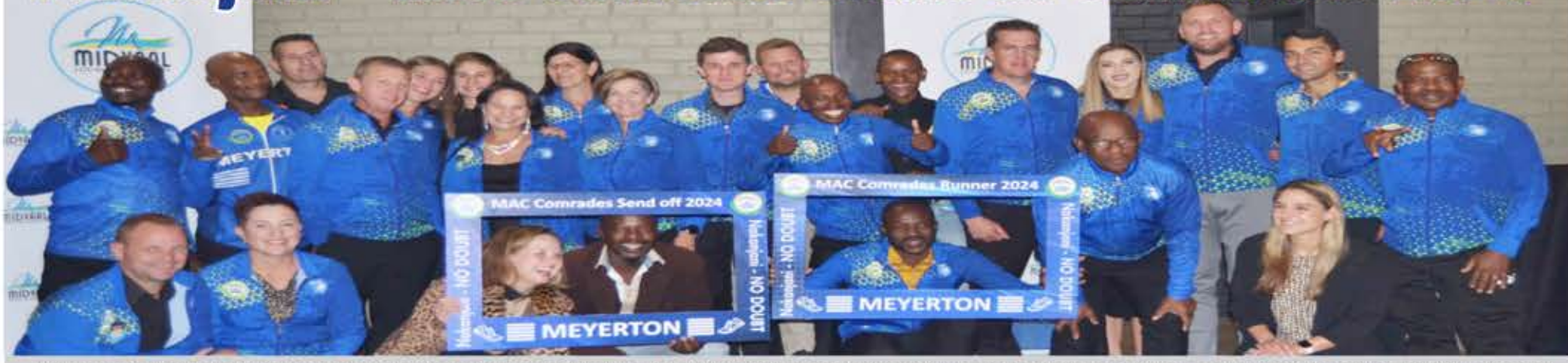
Meyerton Athletic Club Comrades Marathon 2024 participants with Midvaal Local Municipality representatives at the send off event held earlier this month