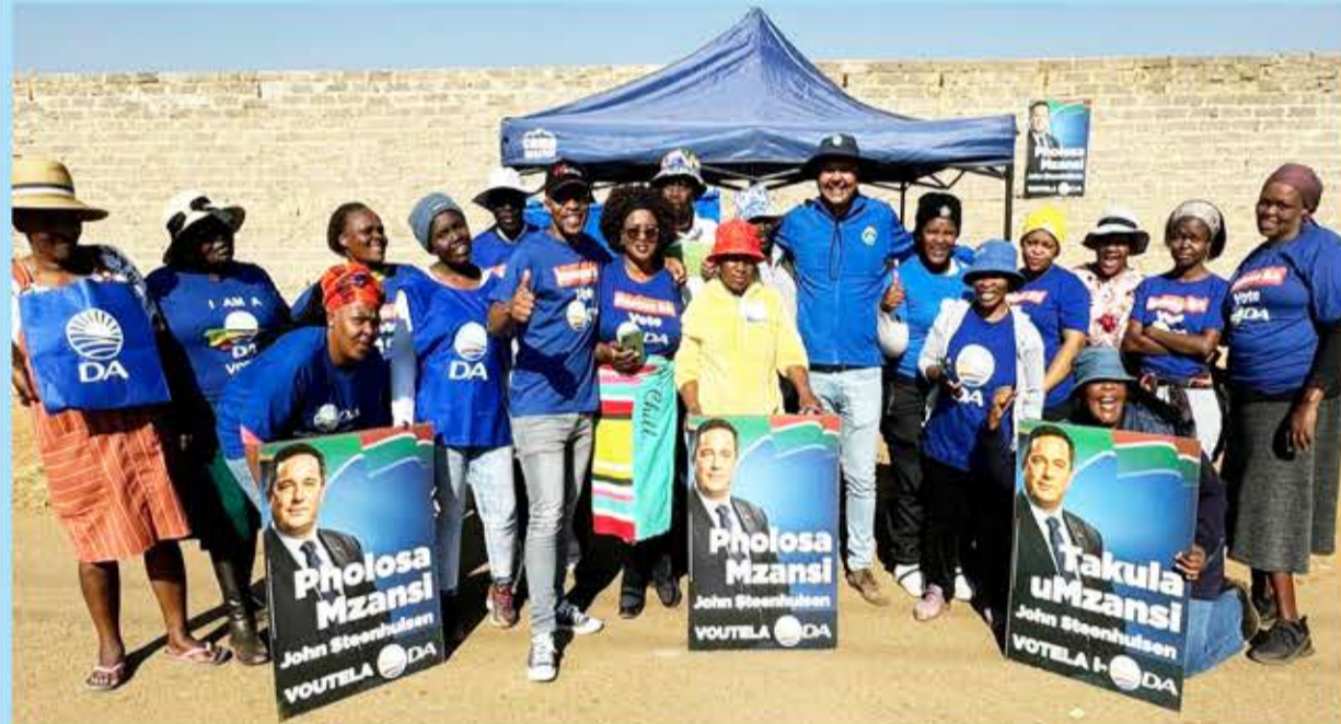
Midvaal DA members during a campaign trail in Sicelo

Following the voting in the 2024 National and Provincial Elections on 29 May, the Electoral Commission has released the results for the national and provincial ballots.