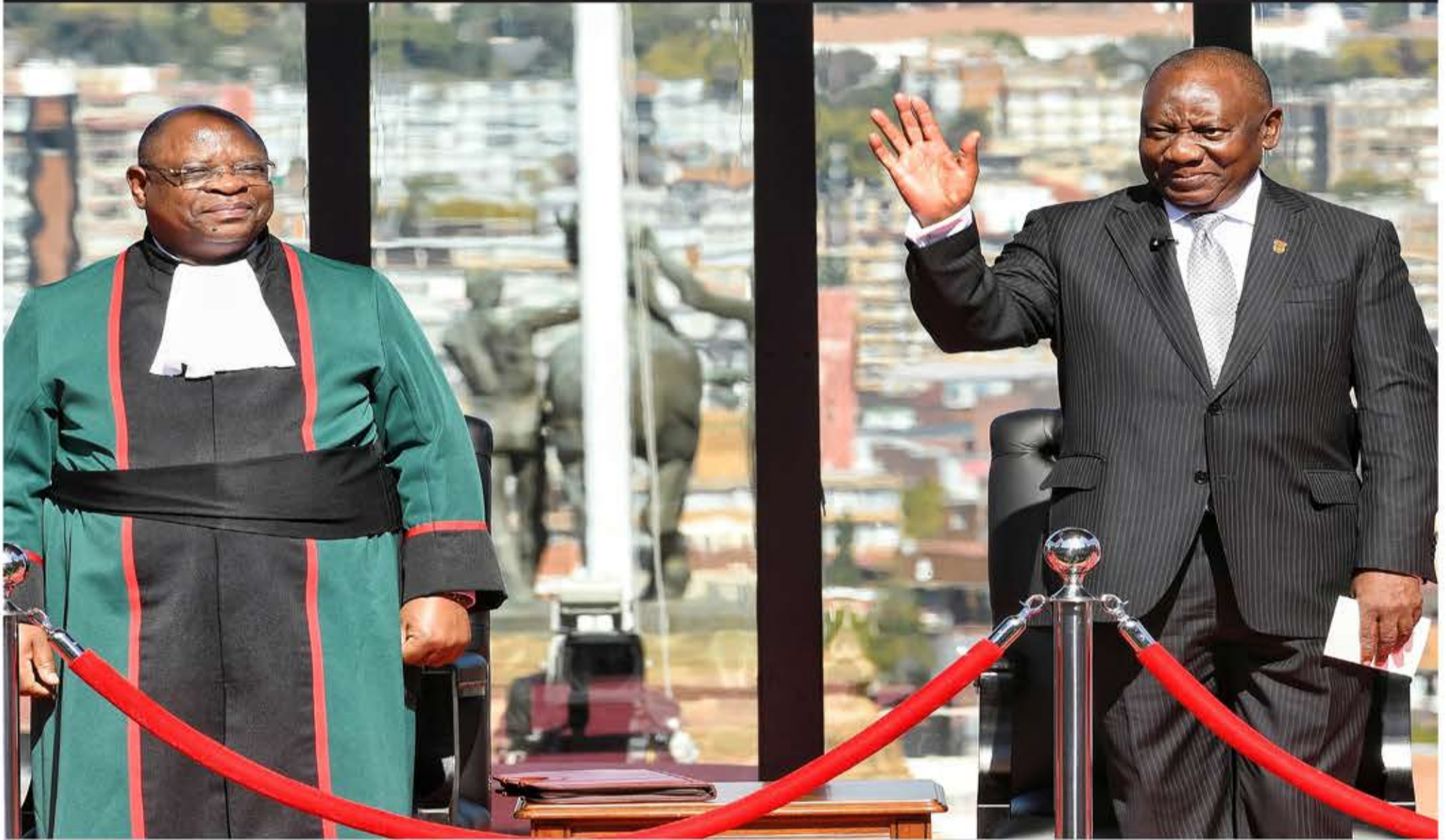
Chief Justice Raymond Zondo alongside President Cyril Ramaphosa at the inauguration in Pretoria, Union Buildings

On 19 June, President Cyril Ramaphosa took his Oath of Office, marking the beginning of South Africa's seventh administration and the establishment of a Government of National Unity.