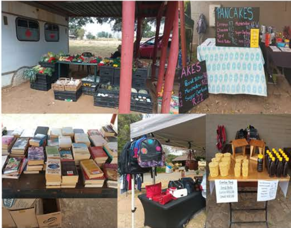
Discover a world of entrepreneurial ingenuity and delish eats at the Market!