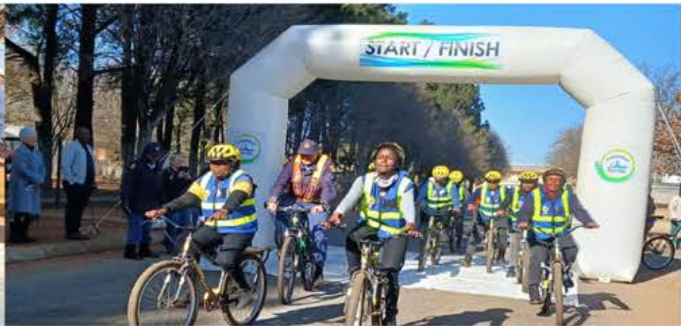
From 15 to 19 July, stakeholders hosted a cycling tour to raise awareness in schools about GBV, substance abuse, teenage pregnancy and gangsterism